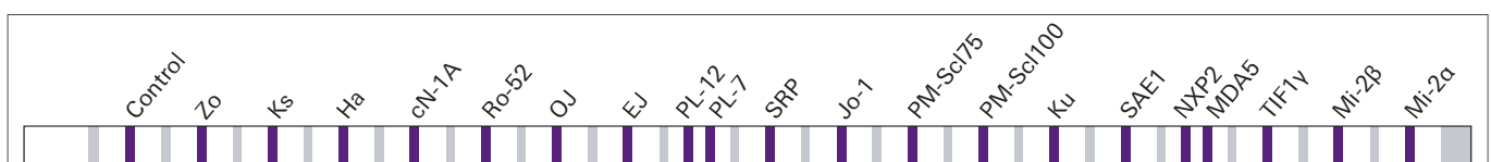
Fig. 2: EUROLINE Profile Autoimmune Inflammatory Myopathies 20 Ag (IgG)

EUROIMMUN offers line blots with antigen combinations for different clinical circumstances. These allow a more efficient and comprehensive analysis than sequential testing. The multiparameter tests cover both MSA and MAA and have particularly high diagnostic value. The inclusion of antigens for the determination of autoantibodies with low prevalences increases the serological detection rate. 7-9 The EUROLINE Profile Autoimmune Inflammatory Myopathies 20 Ag (IgG) (Fig. 2), for example, combines 20 target antigens in a single test strip including – the worldwide exclusive – cN-1A. Autoantibodies against cN-1A are the first and only known serological marker for IBM. 6 The recent addition of Ha, Ks and Zo expands the tRNA synthetase antigen spectrum for ASS differential diagnostics.