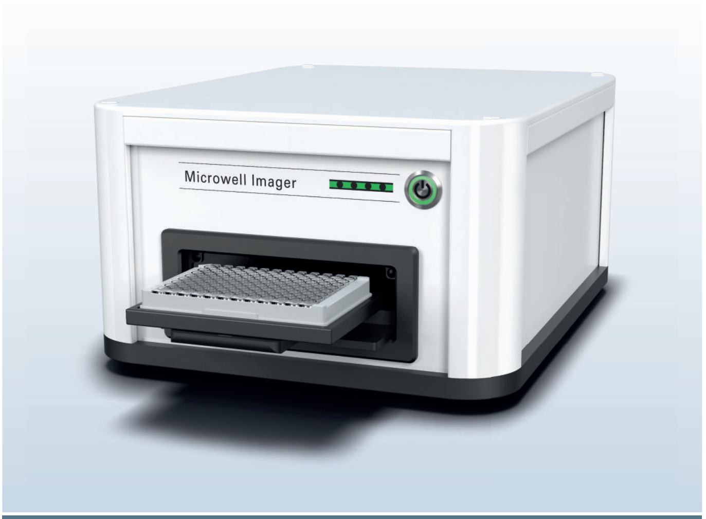
Image acquisition and evaluation of EUROMicroblots