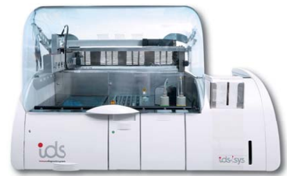
IDS-iSYS Multi-Discipline Automated System